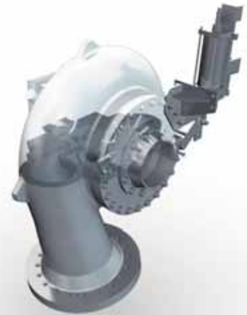
Highly flexible due to variable impeller sizes and inlet guide vanes