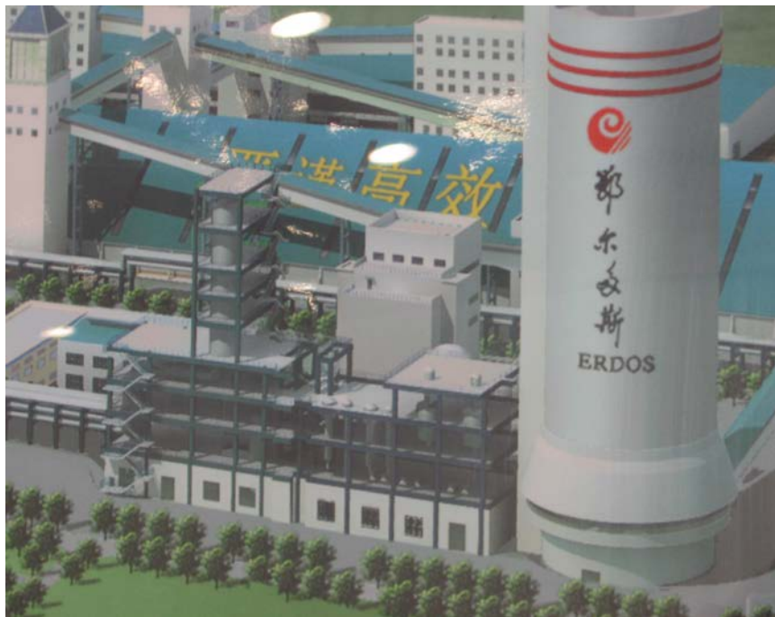
Artist impression of the Erdos Project

We were involved in many interesting projects. For example relocating two TEC conventional urea plants from South Korea to Inner Mongolia in China and revamping it into the largest PoolCondenser urea plant at that time. The design capacity increased with more than 1500 mtpd urea and all new Safurex® high pressure equipment and high pressure piping was included in the Stamicarbon scope of supply. Later we also were involved in the hardware supply for grass root projects: Truly challenging projects.